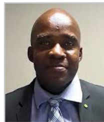
SLINGSBY MDA Founder ESTOQUODES